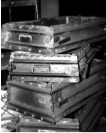
Stack of mold jackets (above), lined with Transite HT. Molds at shake-out with Transite HT bottom boards (top right). Large shell core machine with Transite HT plate (right and below).

Structural High Temperature Insulations for Foundries